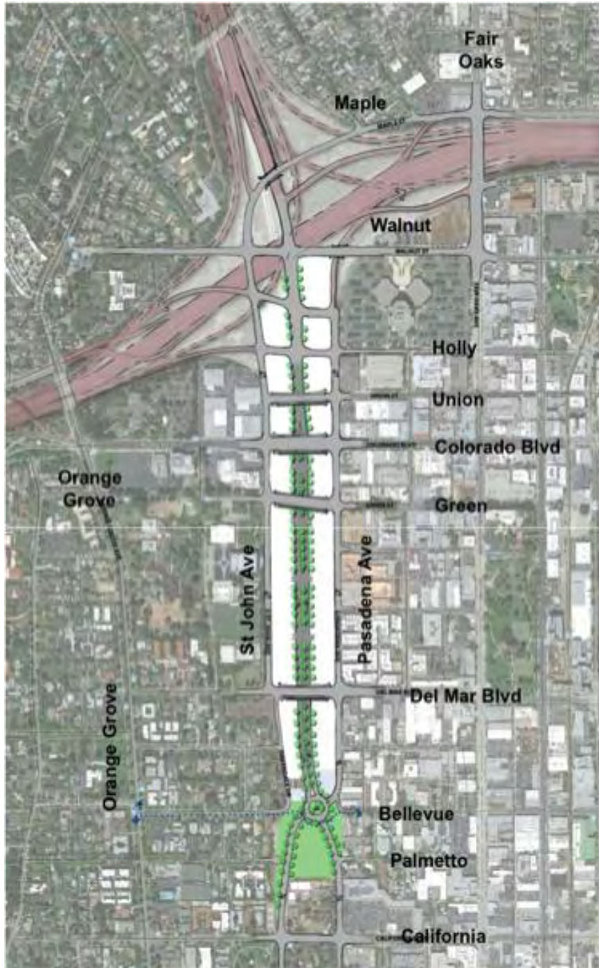
Figure 2 | Option B (Retain Most of the Current Grades)